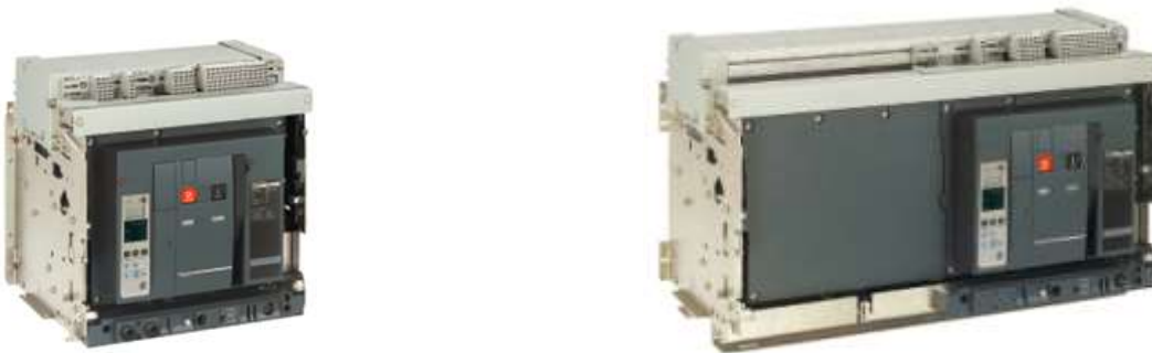
Masterpact NW Circuit Breaker Rating 800 to 6300A

Illustration 1: Typical Photo of Master pact NW Circuit Breaker (3, 4 6 or 8 Pole) P 4P 6P 8P in fixed and draw-out versions